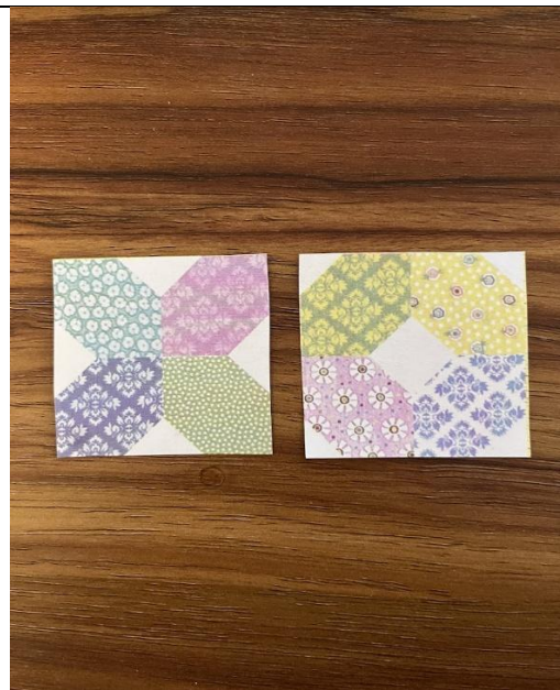
4 blocks joined together to form the X or O